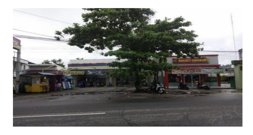
Figure 5. Means of Trade and Commerce in South Banjarmasin District

The development of the market reflects the government's determination in improving economic competitiveness as well as encouraging people's trading activity. The existence of this facility is expected to have a positive impact on the well-being of traders through increased sales, as well as promote active economic turnaround, which in turn can significantly spur growth and development of the region (Sadarudin et al., 2023). In South Banjarmasin District, there are a number of means of trade and commerce that include various types of business and commercial activities. The shops numbered 3, providing a variety of goods needed by the community. The market, of 15 pieces, is the main place for traders and consumers to transact. Convenience stores, numbering 16, provide a variety of daily necessities with a more modern store format. The shops/stalls, totaling 832 units, are small places scattered throughout the district, allowing people to shop in locations close to their homes. Restaurants/cafeterias, with a total of 29, provide diverse culinary options for the residents of the district. These facilities have decent and good buildings, thus supporting the trade and commerce activities that take place in the region. Access to trading places is very easy, and most of them are located close to public transport lines, making them more accessible to the public.