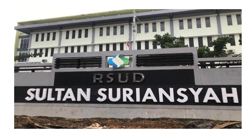
Figure 3. Health Facilities in South Banjarmasin District

In South Banjarmasin District, there are various health facilities that include 1 hospital, 8 polyclinics/treatment halls, 2 health centers with inpatient services, and 4 health centers without inpatient services. In addition, there are also 30 pharmacies that provide medical needs and pharmacy services. Accessibility to these various health facilities is very easy, as they are located close to public vehicles and are within easy reach of the public. In addition, the buildings of these health facilities are generally still in good condition and worthy of use.