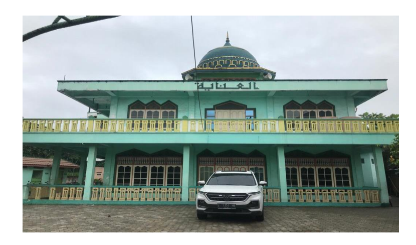
Figure 4. Religious Facilities in South Banjarmasin District

facilities of these various places of worship are generally in a fairly decent condition for use, thus allowing the community to conduct worship comfortably. Access to these places of worship is very easy, as many of them are located close to public transport links.