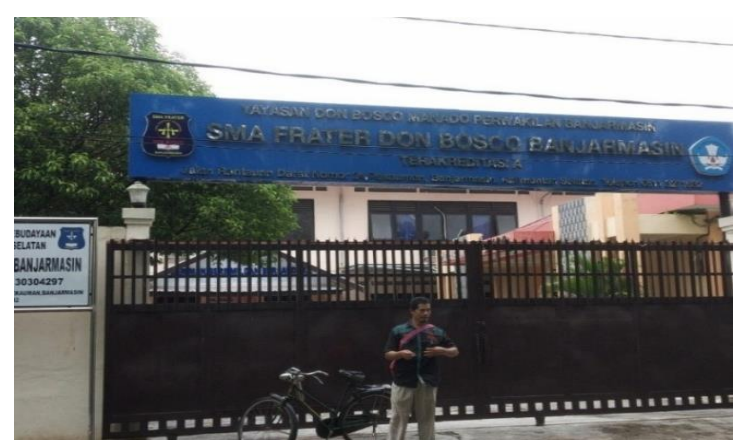
Figure 2. Educational Facilities in South Banjarmasin District