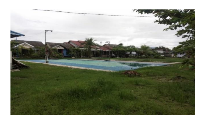
Figure 6. Sports Field Facilities in South Banjarmasin District

The Green Open Space Facility (RTH) has the aim of maintaining the balance of the residential environment and supporting the survival of the population in the region by providing a source of fresh air and sunlight (Choiriyah & Prasetiyo, 2018; Munawir et al., 2022a). In South Banjarmasin District there are as many as 5 playgrounds, in addition, there are 7 parks and sports fields that are used by the community for various types of sports and leisure activities. Also, there are 30 cemeteries that are the final resting places for the citizens of the community. The facility is located close to public vehicle access and easy to reach by various sections of the public.