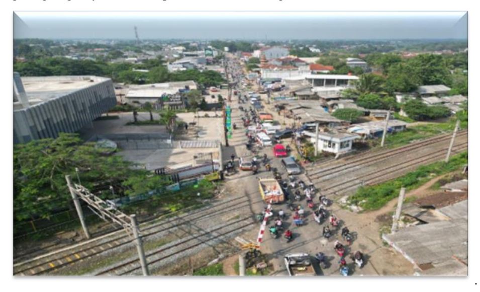
Figure 1. Initial Conditions of Employment

the Cisauk flyover. Figure 1 shows the initial condition of the work located in the Cisauk District area of Tangerang Regency. The Cisauk flyover construction project is a regional strategic project of Tangerang Regency which is expected to unravel congestion at that location.