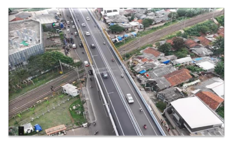
Figure 2. Final Condition of Work

Figure 2 above shows the flyover construction work that has been completed. Based on the background of the problem above, the following problem formulations are obtained: what factors resulted in the Contract Change Order on the Cisauk flyover construction project, what factors affect the Contract Change Order on the Cisauk flyover construction project, what is the most dominant factor in influencing the Contract Change Order on the Cisauk flyover construction project?