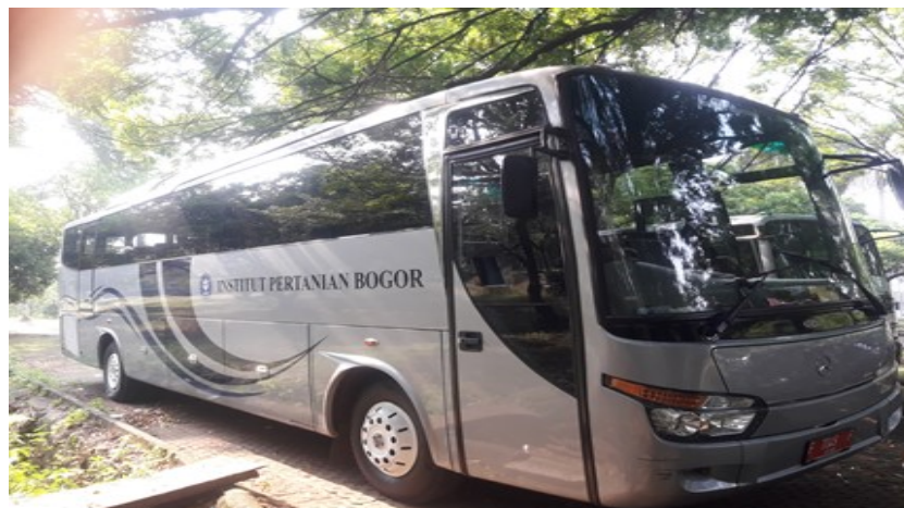
Figure 1. Campus Bus