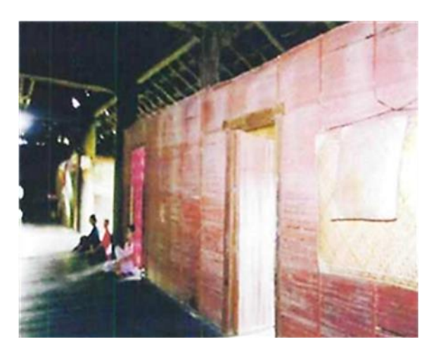
Figure 4. Bedroom

In the Betang House, the bedrooms must be arranged in a row along the length of the Betang building. The placement of the bedroom for children and parents has certain provisions where the bedroom for parents must be at the very end of the river and the bedroom for the youngest child must be at the very end of the downstream river, so the bedroom for parents and youngest child should not be flanked and if so violated will be disastrous for the whole house. At Betang House now the children's and parents' bedrooms do not follow the provisions as in the Betang House before. Placement of bedrooms for children and parents is now based on the wishes and needs of residents.