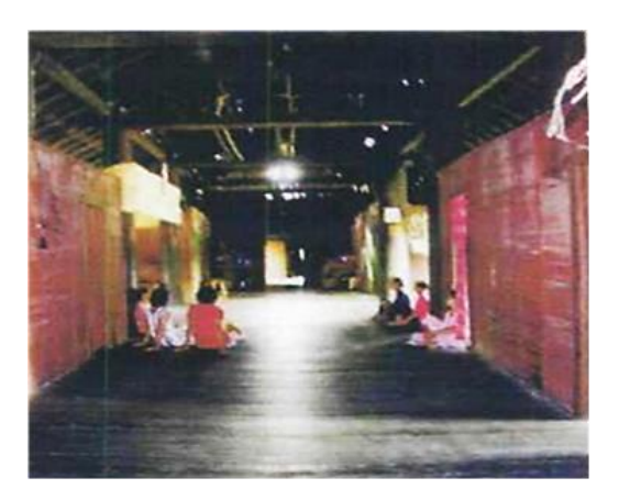
Figure 3. Los Room

In Rumah Betang II, the los room is still maintained as an open area and a liaison between the rooms on the right and left sides of the los room and is still used as a gathering room with relatives or house members. In Rumah Betang now the los room has been replaced by a living room like modern houses in general as a place to gather. The meaning of the los room at Rumah Betang now still survives as a gathering place, but in terms of shape and layout it is much different from the Betang House before.