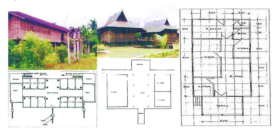
Figure 2 . Development of the Betang House Plan, top-down: Betang then-Betang now

The space in the Betang house is always on one wall that covers the space as a whole, so it can be called a closed space. It is different with the Betang II house where the spaces are on different real walls and the real space has a direct relationship with the outside, so it is called open space (Suptandar, 1999:62).