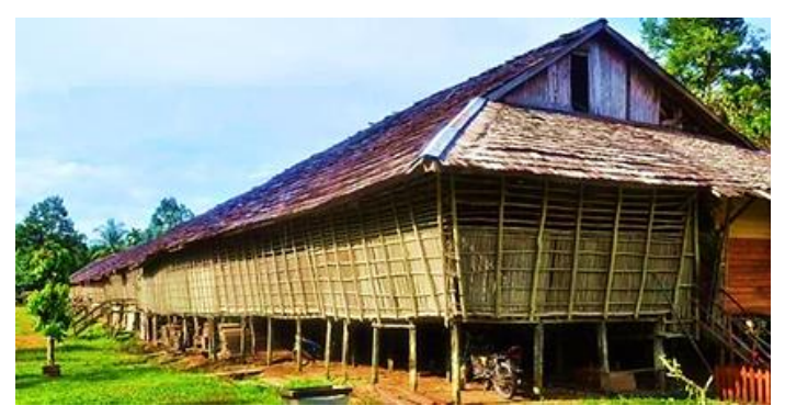
Figure 1. Central Kalimantan Betang House

Starting from the flood, because usually this house will be built on the river bank. Then also to avoid the threat of wild animals until the enemy suddenly attacks. What makes this Betang house even more unique is its elongated shape. Even the length can reach 150 meters and even more with a height of about 30 meters. This is because in one house will be occupied by more than one family.