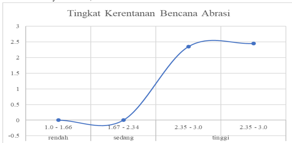
Figure 1. Abrasion Disaster Vulnerability Level

Classification of the level of vulnerability of coastal areas to the threat of coastal abrasion, illustrates that the coastal area of North Galesong District has the same level of vulnerability. Based on the results of the overall analysis, the village/kelurahan vulnerability in North Galesong District is in the high category. The area vulnerability map is shown in the following figure