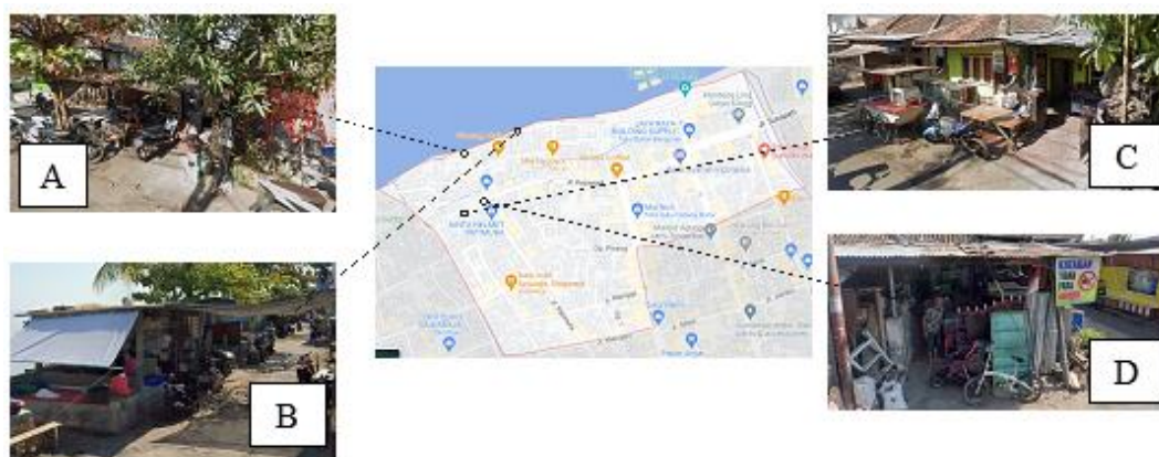
Figure 2. Fix and Semi Fix Elements as Territory Markers in Bugis Village

Figure 1 shows that residents have defined their territory with clear markers so that their territory will be clearly visible. It can be seen that the boundaries used are mostly made of concrete and combined with fences made of iron which are classified as fix element markers.