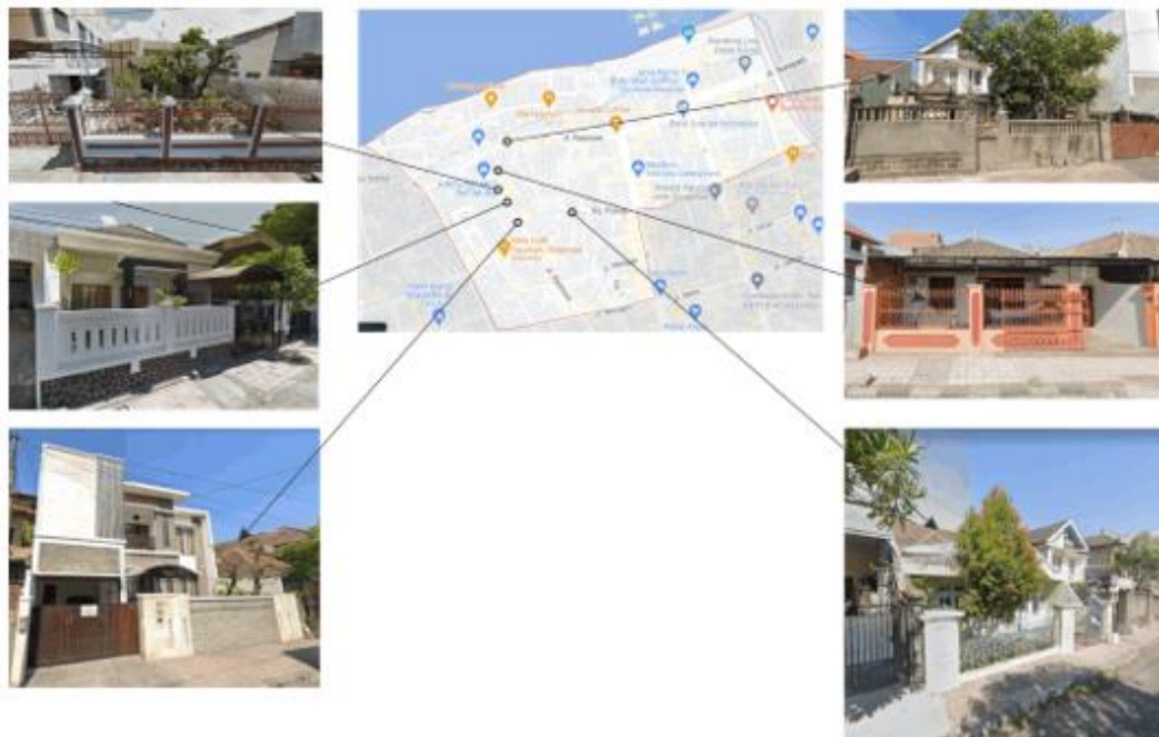
Figure 1. Fix Elements as Territory Markers in Bugis Village

several forming elements, both fixed and semi-fixed elements. Some houses have used a massive barrier (fix element) to define their territory and others have used a non-massive barrier (semi-fixed element) and some even have no boundaries at all. Based on the results of observations in the field, the following are some variations of the limiting elements in settlements.