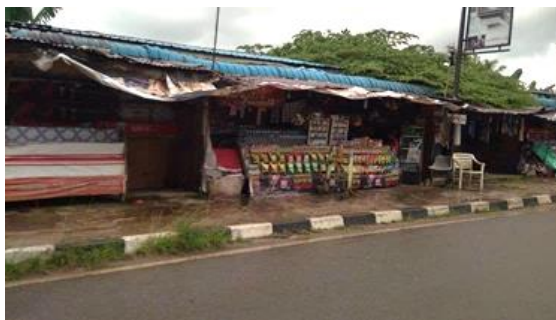
Figure 1. Settlement Conditions Before Relocation

As we know, the major rivers and several tributaries that cross the City of Batam, have the potential as the main drainage function of the city. However, over time developments in urban areas have caused the function of the river to change. One of them is the emergence of slums on the banks of the river. This condition greatly impacts the environment, which will gradually disrupt the function of the river as a catchment area.