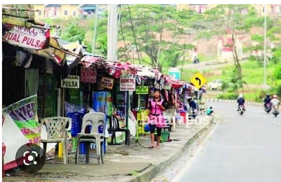
Figure 7. Current Existing Conditions

Positively, the effect is the improvement of physical environmental conditions and the development of residential areas, while the negative effect is related to the hampered economic mobility due to unsupportive accessibility which affects the post-relocation area development process. So that the goal of reconstructing the community's conception of settlement relocation can be achieved. This is in line with the understanding that social phenomena in the field have a double meaning. Emphasis is given to human behavior and the results of interactions between community members, including their interactions with the surrounding environment. The results of the study provide a description of several social and spatial phenomena that exist in the settlement relocation area. The final process of the interaction between social and spatial phenomena shows that there are four community conceptions about settlement relocation. Conception of settlement relocation includes: (1) acknowledgment of community existence; (2) partiality to capital owners; (3) opportunity to obtain cheap land; (4) opportunities for economic activity. Equally important, community strategies were also found in response to the environmental conditions of the settlements. These strategies include: (1) Help Unions; (2) changing professions and looking for side jobs; (3) building emergency houses; (4) utilization of house space as a place of business.