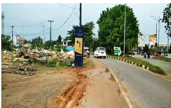
Figure 2. Conditions of Slum Settlements in Simpang Bareleng, Batam City

To overcome housing and slum settlement problems, it can be done in two ways (Khomarudin, 1992), namely: