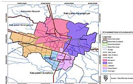
Figure 4. Batam City Area Map

The physical condition of the topography is relatively flat with an average height of 0-3%, bearing in mind that Batam City is traversed by several large rivers, the consequence of which is that Batam City often experiences inundation or flooding due to the overflow of these rivers, especially in areas along their streams.