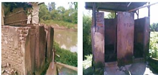
Figure 5. Conditions of Public MCK

Most people who live in these settlements do not have private MCK. For the purposes of bathing and defecating, people use public toilets. Public MCK was built independently by the community.