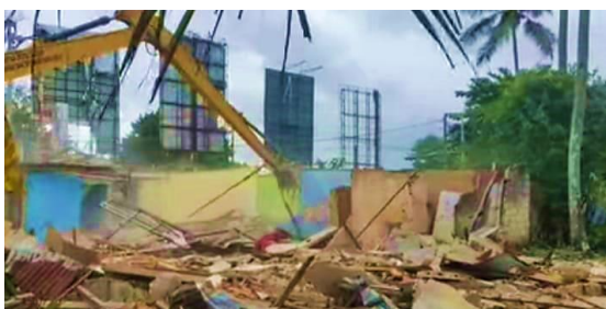
Figure 6. Cleaning of Illegal Settlement Areas