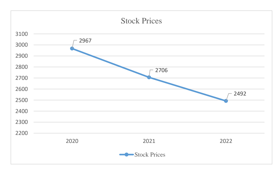
Figure 1. Stock Price Chart

The current economic growth in Indonesia is evidenced by the rapid development of the capital market where currently there are many companies listed on the Indonesia Stock Exchange and making public interest increasingly high to invest. Stock are one of the financial instruments that are widely used to invest in the capital market. In the capital market, investors calculate how to set stock prices by considering the risk and rate of return (Giyartiningrum et al., 2023). The market economy system is based on the principles of good corporate governance (KNKG, 2006). Good Corporate Governance, financial performance and firm value become a reference for high and low stock prices so that investors can assess the best company to invest in. Empirical studies conducted on the IDX often show that manufacturing companies with better GCG practices tend to have better financial performance and higher firm value.